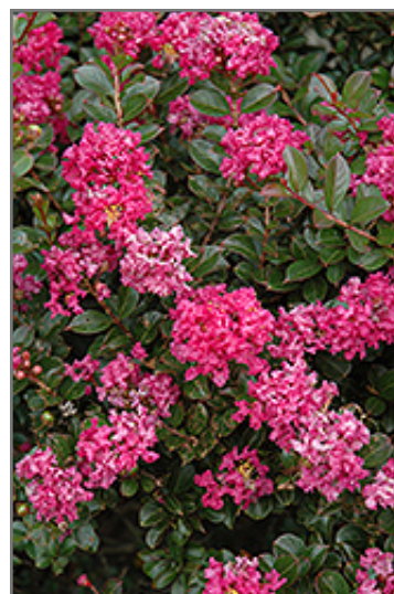
Pocomoke Crapemyrtle flowers