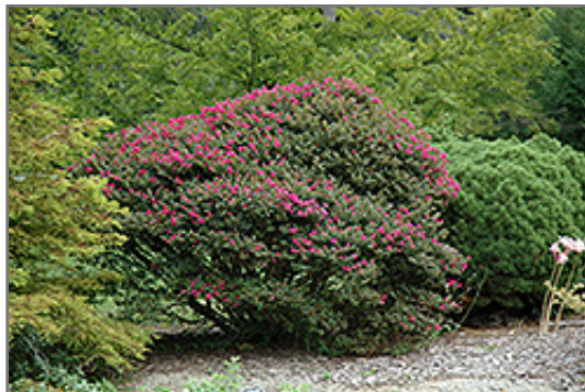
Pocomoke Crapemyrtle in bloom