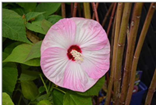
Luna Pink Swirl Hibiscus flowers

Luna Pink Swirl Hibiscus is recommended for the following landscape applications;