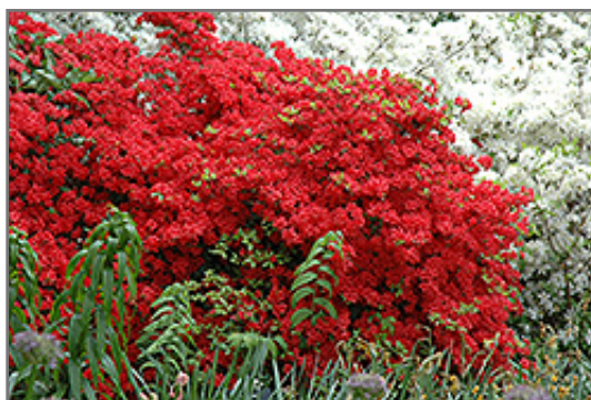
Stewartstonian Azalea in bloom