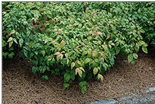
Fire Power Nandina