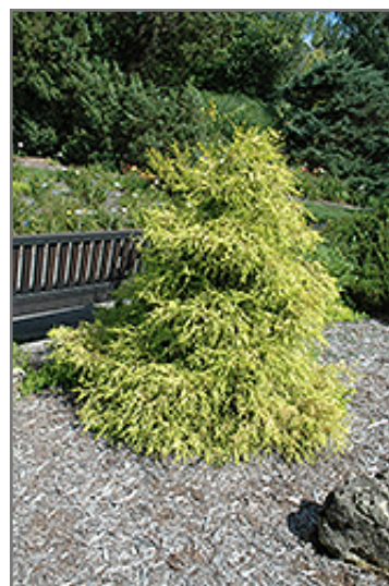
Lemon Thread Falsecypress