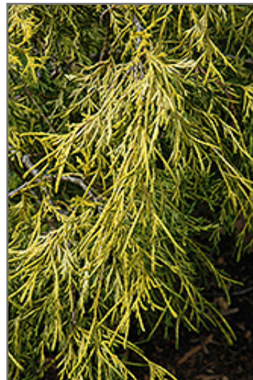
Lemon Thread Falsecypress foliage