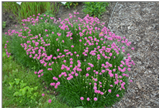
Bloodstone Sea Thrift in bloom