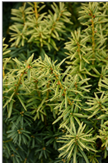
Dwarf Bright Gold Yew foliage