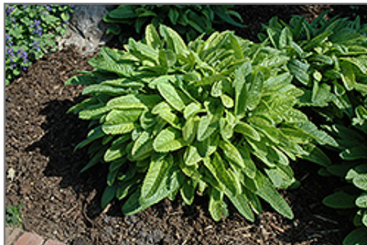
Hummelo Betony