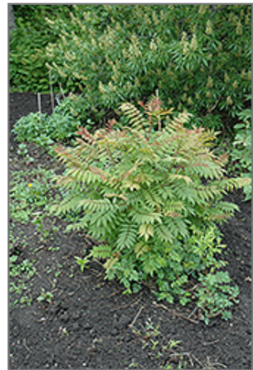
Sem False Spirea