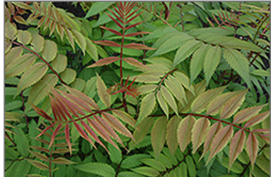
Sem False Spirea foliage

Sem False Spirea is recommended for the following landscape applications;