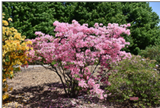
Northern Lights Azalea in bloom