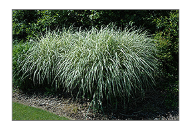
Rigoletto Maiden Grass

4404 Rainbow Dr. Jefferson City, MO, 65109 phone: 573-353-2019 www.gardens2gomo.com