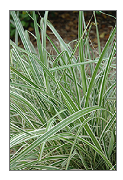
Rigoletto Maiden Grass foliage