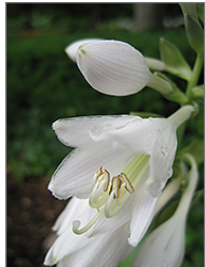
Frances Williams Hosta flowers