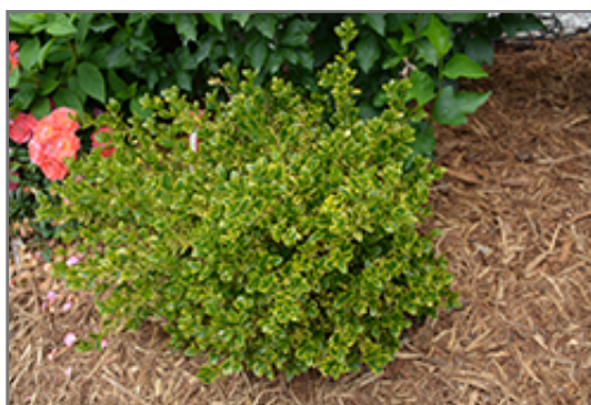
Wedding Ring Boxwood