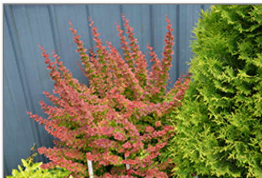
Sunjoy Tangelo Japanese Barberry