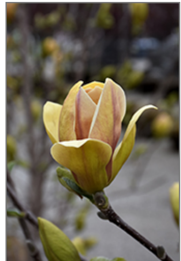
Sunsation Magnolia flowers