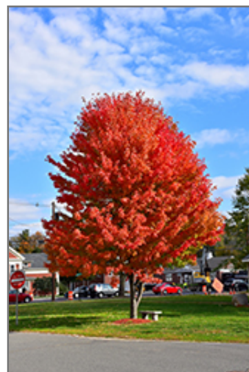
Autumn Splendor Sugar Maple in fall