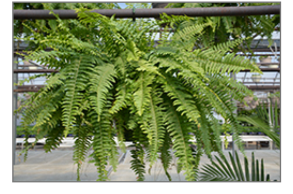
Boston Fern