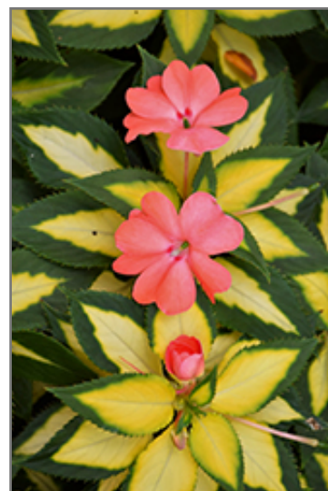
SunPatiens Spreading Salmon New Guinea Impatiens flowers

SunPatiens Spreading Salmon New Guinea Impatiens is recommended for the following landscape applications;