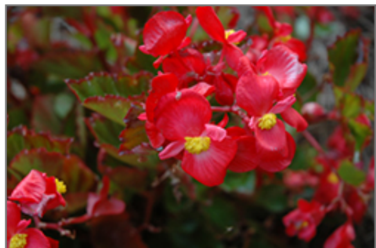
BabyWing Red Begonia flowers