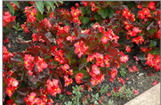
BabyWing Red Begonia flowers

BabyWing Red Begonia is recommended for the following landscape applications;