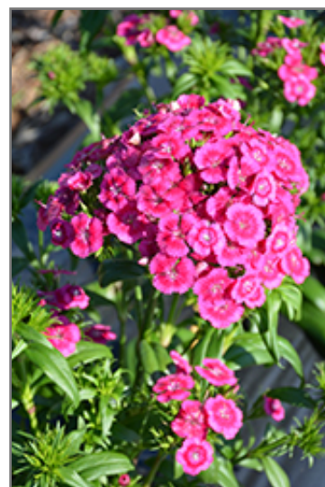
Jolt Pink Hybrid Pinks flowers