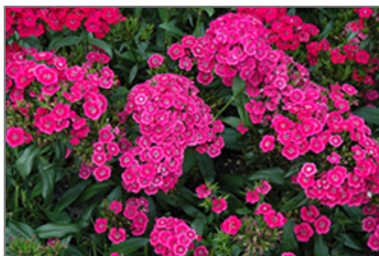
Jolt Pink Hybrid Pinks flowers

Jolt Pink Hybrid Pinks is recommended for the following landscape applications;