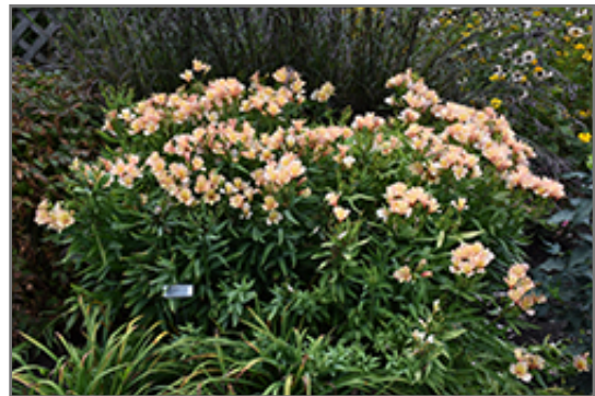
Inca Ice Alstroemeria in bloom