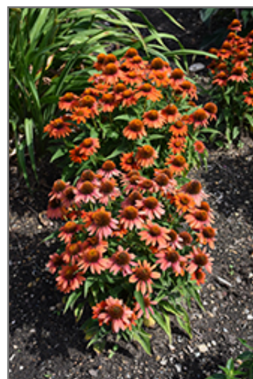
Sombrero Adobe Orange Coneflower in bloom