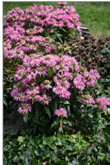
Pardon My Pink Beebalm in bloom