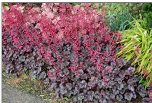
Glitter Coral Bells in bloom

Glitter Coral Bells is recommended for the following landscape applications;