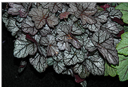
Glitter Coral Bells foliage