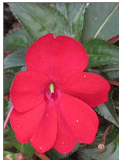
SunPatiens Compact Red New Guinea Impatiens flowers

SunPatiens Compact Red New Guinea Impatiens is recommended for the following landscape applications;