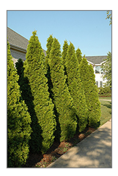
Emerald Green Arborvitae