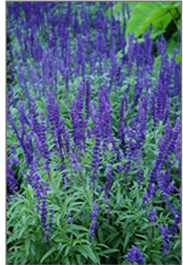
Victoria Blue Salvia flowers

Victoria Blue Salvia is a fine choice for the garden, but it is also a good selection for planting in outdoor pots and containers. With its upright habit of growth, it is best suited for use as a 'thriller' in the 'spiller-thriller-filler' container combination; plant it near the center of the pot, surrounded by smaller plants and those that spill over the edges. Note that when growing plants in outdoor containers and baskets, they may require more frequent waterings than they would in the yard or garden.