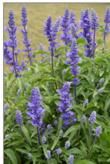
Victoria Blue Salvia flowers