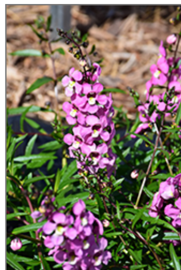
AngelMist Spreading Pink Angelonia flowers

AngelMist Spreading Pink Angelonia is recommended for the following landscape applications;