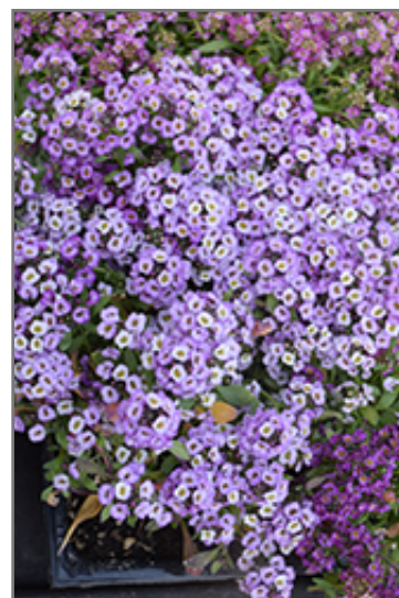
Clear Crystal Lavender Shades Sweet Alyssum flowers

Clear Crystal Lavender Shades Sweet Alyssum is recommended for the following landscape applications;