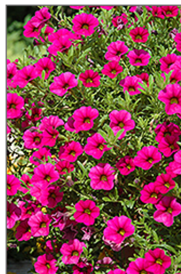
Cabaret Rose Calibrachoa flowers