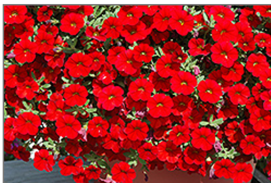
Cabaret Bright Red Calibrachoa flowers

Cabaret Bright Red Calibrachoa is recommended for the following landscape applications;