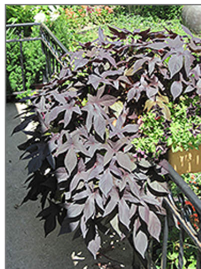
Proven Accents Blackie Sweet Potato Vine