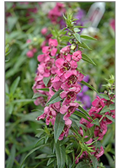
Pink Angelonia flowers