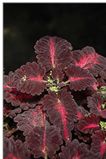
Black Dragon Coleus foliage

Black Dragon Coleus will grow to be about 18 inches tall at maturity, with a spread of 12 inches. When grown in masses or used as a bedding plant, individual plants should be spaced approximately 10 inches apart. Although it's not a true annual, this fast-growing plant can be expected to behave as an annual in our climate if left outdoors over the winter, usually needing replacement the following year. As such, gardeners should take into consideration that it will perform differently than it would in its native habitat.