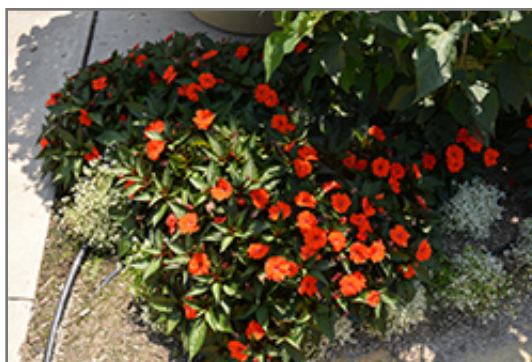
SunPatiens Compact Orange New Guinea Impatiens in bloom

SunPatiens Compact Orange New Guinea Impatiens will grow to be about 24 inches tall at maturity, with a spread of 24 inches. When grown in masses or used as a bedding plant, individual plants should be spaced approximately 20 inches apart. Its foliage tends to remain dense right to the ground, not requiring facer plants in front. This fast-growing annual will normally live for one full growing season, needing replacement the following year.