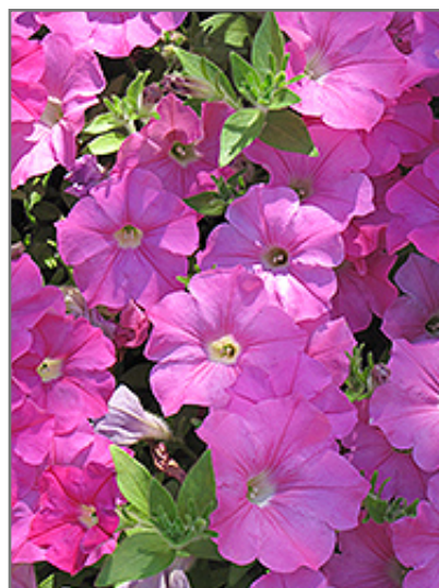
Easy Wave Pink Petunia flowers

Easy Wave Pink Petunia is recommended for the following landscape applications;