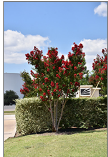
Dynamite Crapemyrtle in bloom