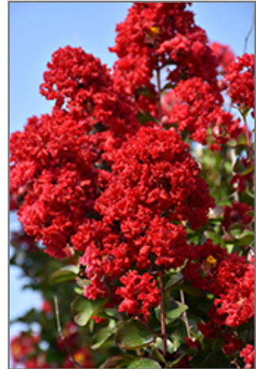
Dynamite Crapemyrtle flowers